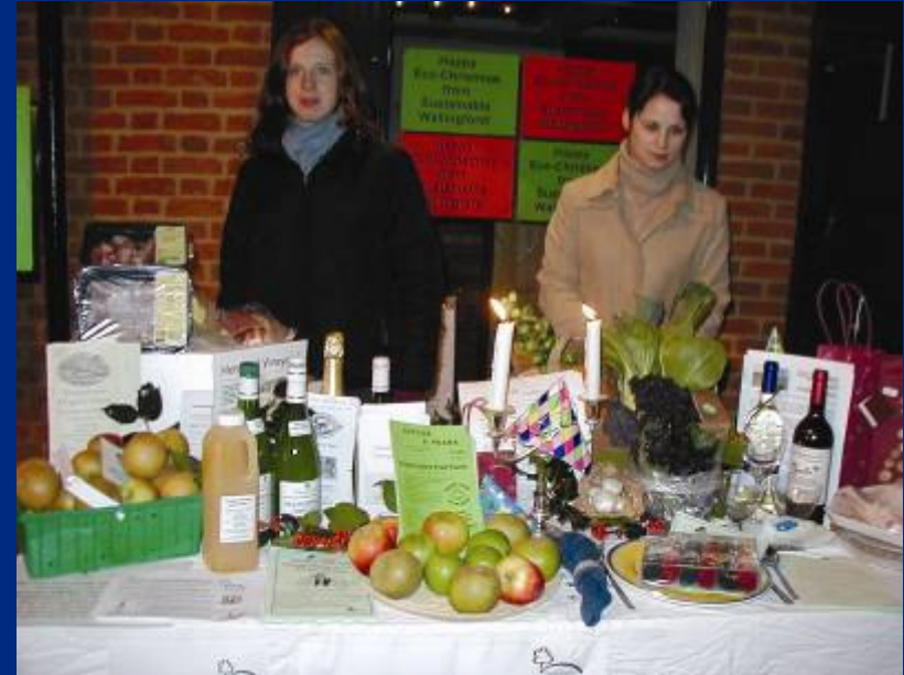
Local food stand at Wallingford Victorian shopping evening – cut Christmas food miles